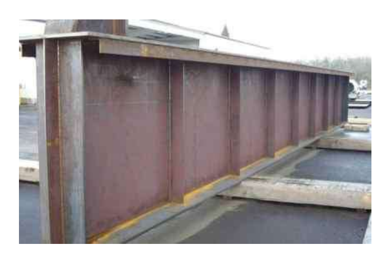
Fig 3: Plate Girder with Vertical Stiffeners